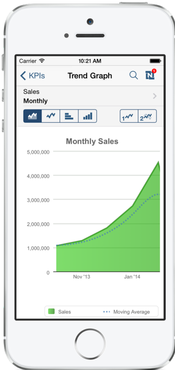
Monitor key performance indicators (KPIs) in real-time.

“WITH NETSUITE, EVERYTHING IS ‘NOW’—THE INSTANT ACCESS TO INFORMATION IS INCREDIBLE.”